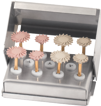
Twist Polishing Kit

Intraoral high-gloss polishing of all composite restorations