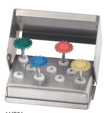
LUSTER® Intraoral Twist Kit

LUSTER® Twist Polisher Kits are especially developed for high-gloss polishing of all ceramic and composite restorations. The flexible polishing lamellae make it possible to adapt to any surface and render flawless results in areas that are difficult to reach, such as occlusal surfaces.